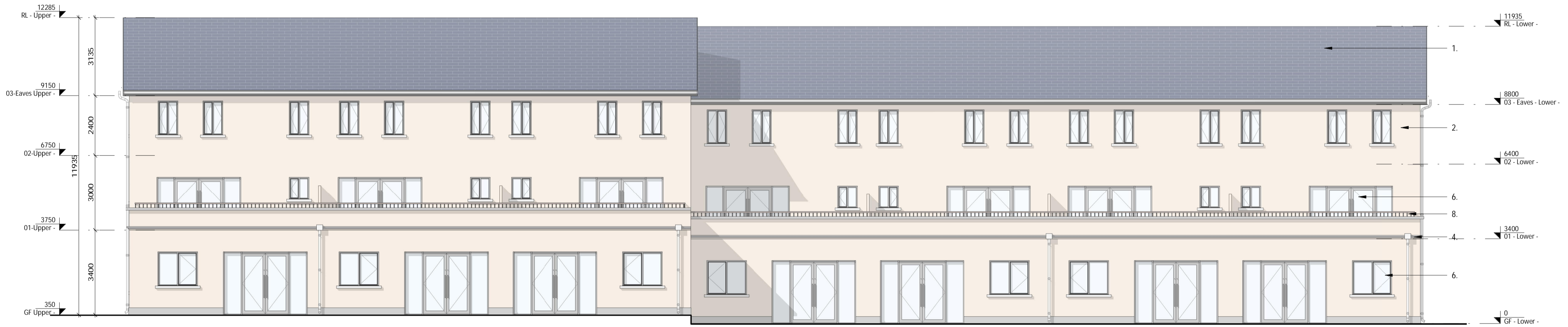
4 Rear Elevation 1:100